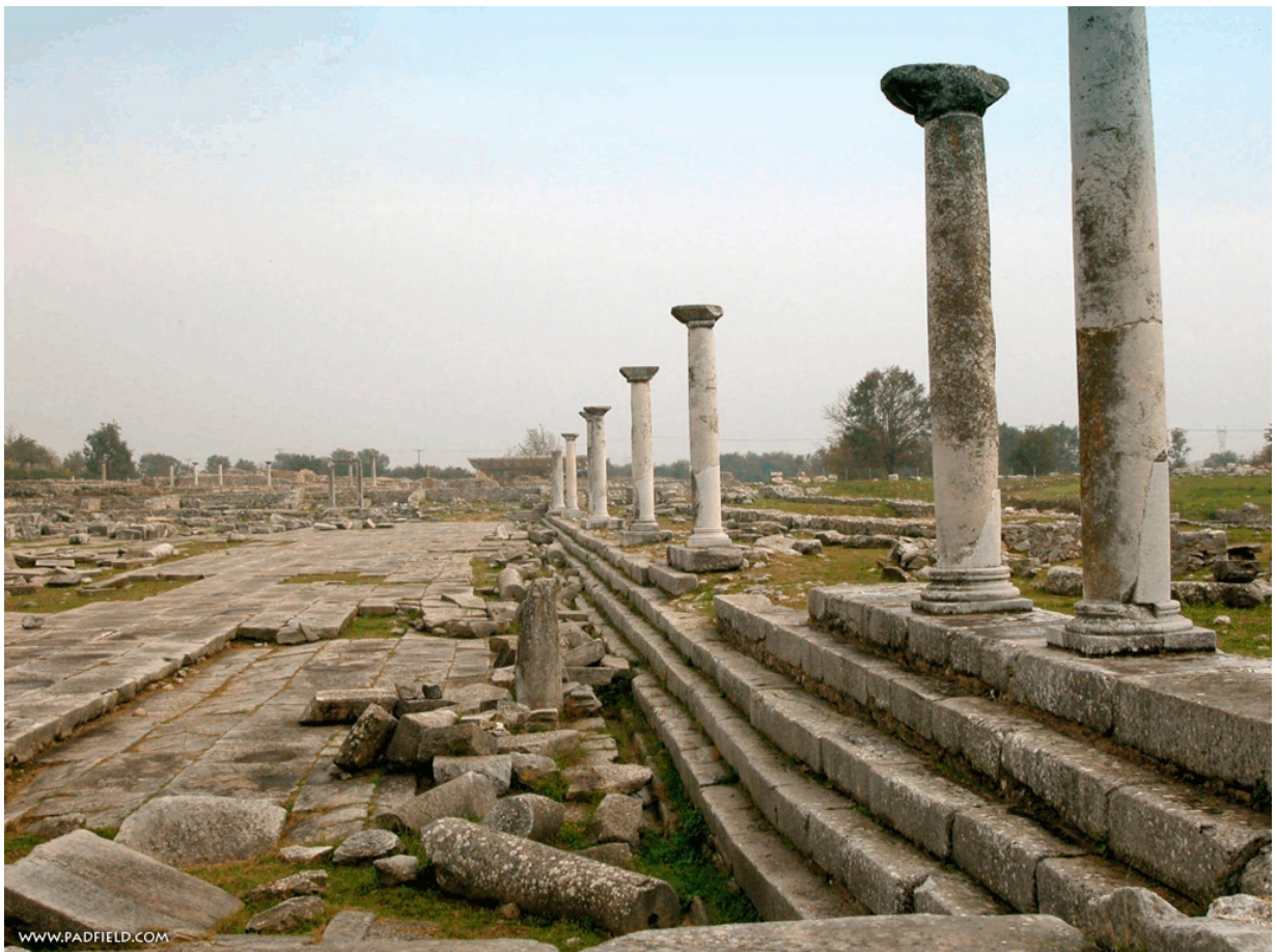
The Roman Forum at Philippi